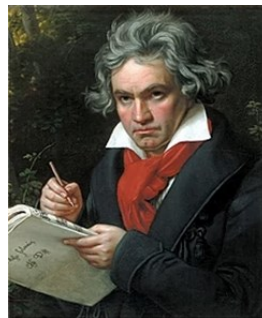
Ludwig van Beethoven (1820) By Joseph Karl Stieler