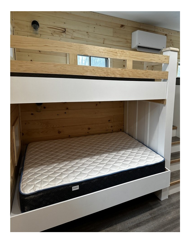
Double Bunk Beds