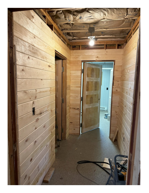
Hallway to Bunkroom & Bathroom

This past month, the Kentland interior has really begun to take shape. The new ceiling and LED lights make the space look clean and bright, while the pine walls give it that rustic feel that we were hoping for. The restored fireplace now looks better than I ever imagined!