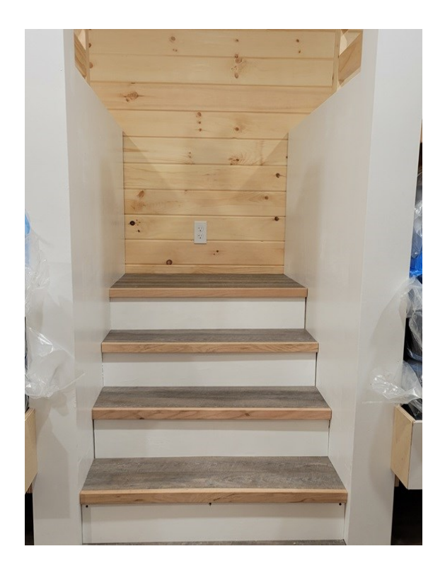
Bunk Bed Stairs