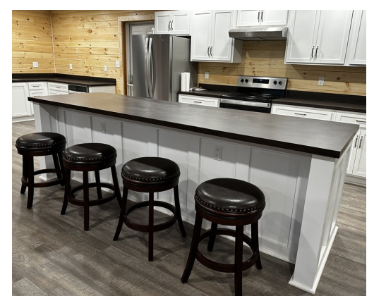
Island Bar Stools